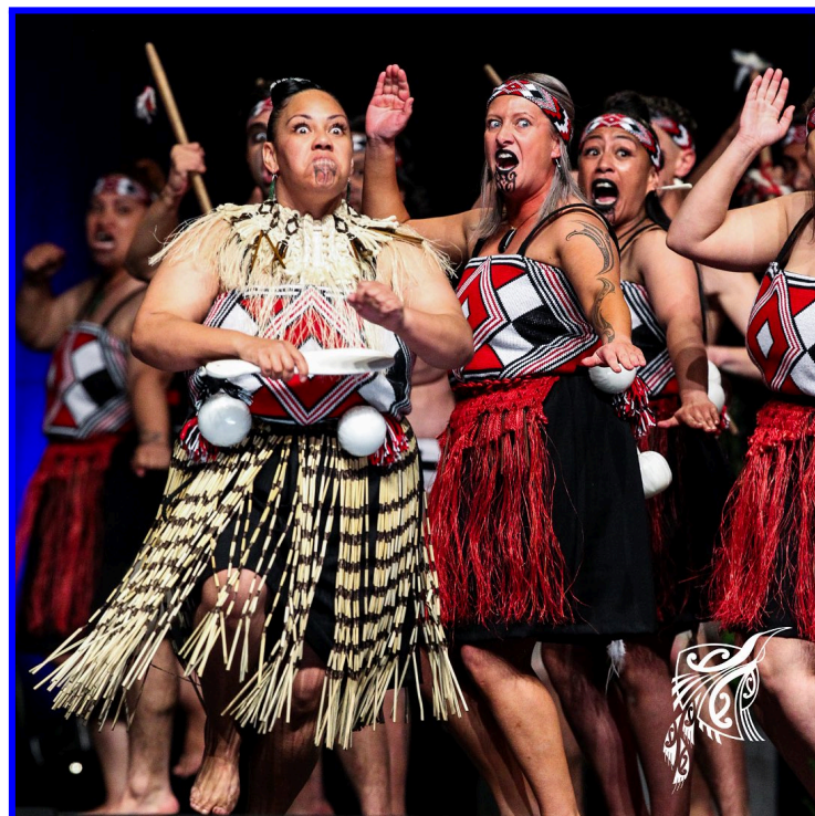
Nga wahine toa o Ngā Hau e Whā Ki Murihiku in full flight - you can watch them in the Waitaha regional finals on Maori TV on Demand.